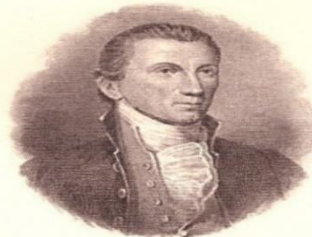
JAMES MONROE MEMORIAL FOUNDATION

James Monroe Birthplace and Park Westmoreland County, Virginia April 22, 2023 10:30 a.m.